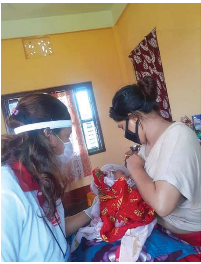
Home base PNC service being provided by Jhapa Branch